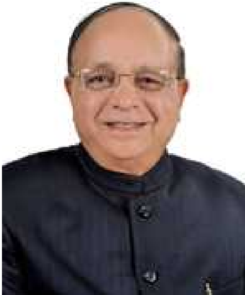
Sh. Bakshi Ram Arora, Hon'ble Mayor, Municipal Corporation, Amritsar.