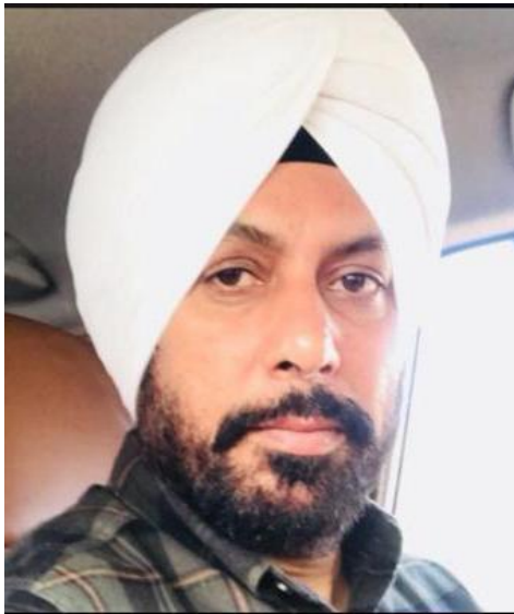
Sh. Karamjit Singh, Hon'ble Mayor, Municipal Corporation, Amritsar.